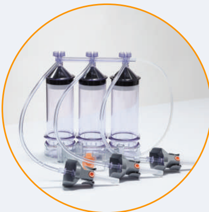
Centargo auto-fills the Day Set at the end of each patient exam.